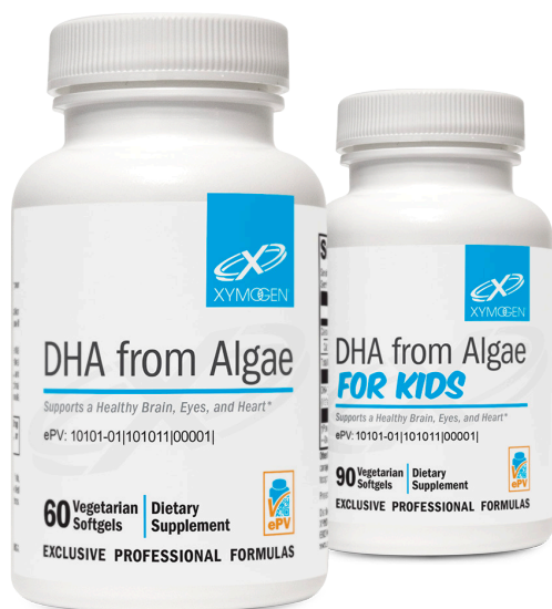
DHA from Algae is available in 60 vegetarian softgels DHA from Algae for Kids is available in 90 vegetarian softgels